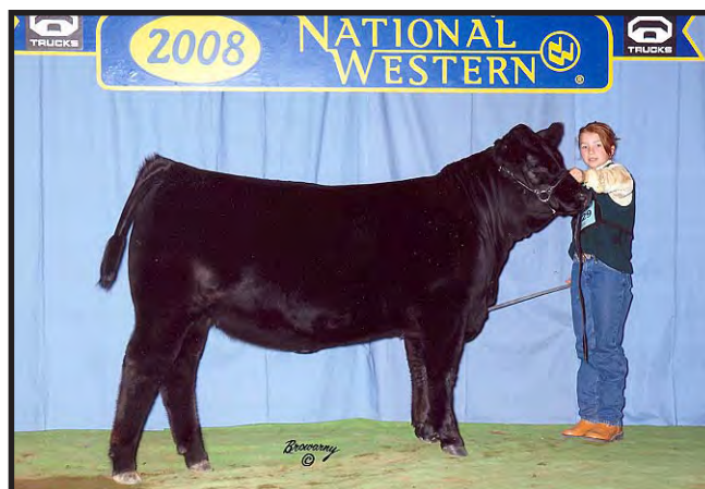
Sydney — Showmanship Champion National Junior Show

3001T—Double black and double polled son of 70M that is larger framed with good growth.