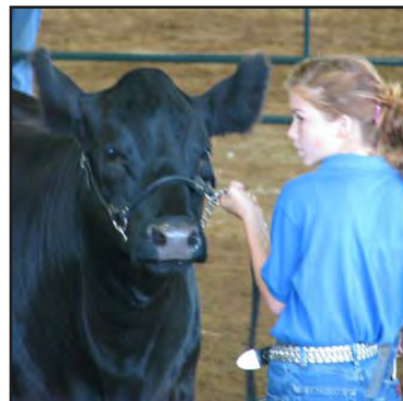
Sydney Champion Showman