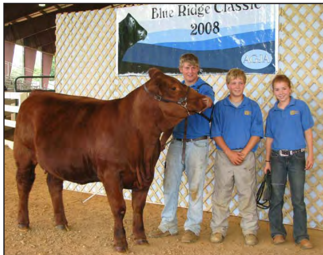
Champion Junior Team Fitting